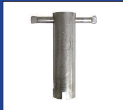
Caire Vent Key