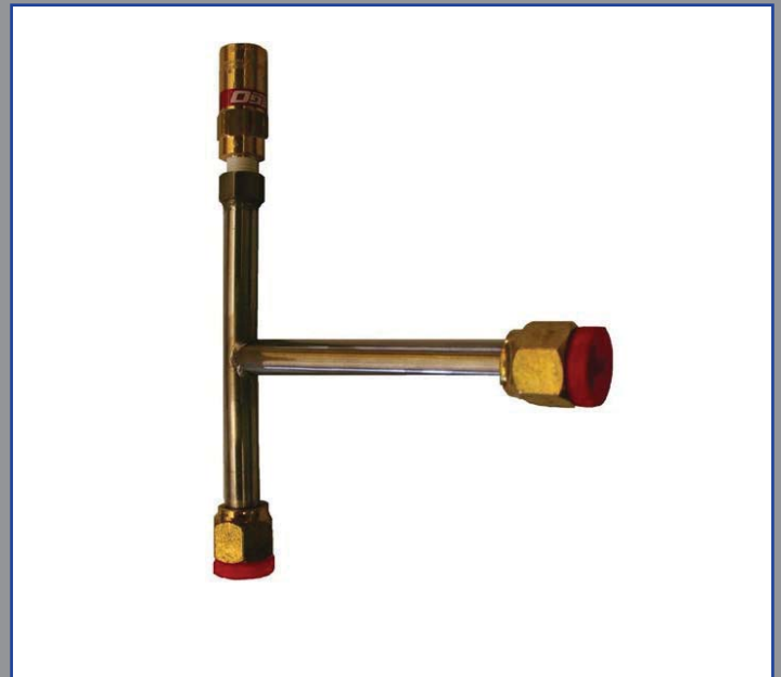
Source Adapter w/ 150 PSI RV P720