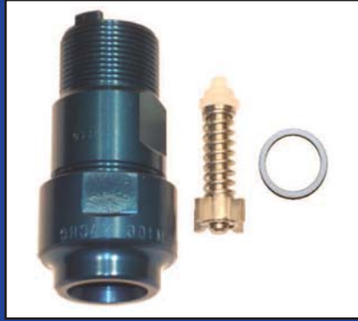
PB Style Posi-Lock Fill Tip