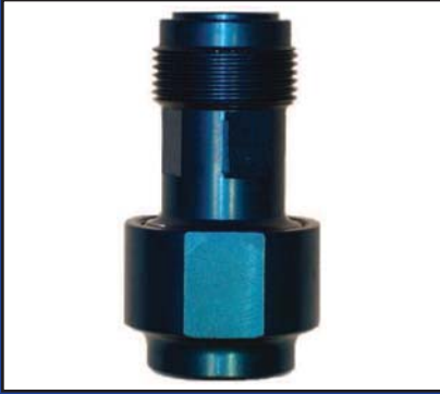
PB Female Quick Connect Fill Head