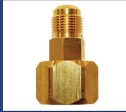
1" to 5/8" Fill Adapter/Reducer