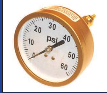
60 PSI Pressure Gauge