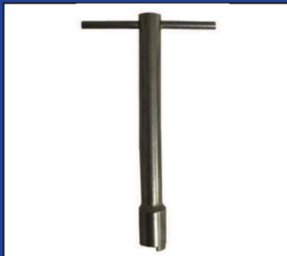
PB Vent Key