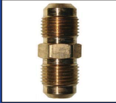
5/8" x 5/8" Male Flare Fitting