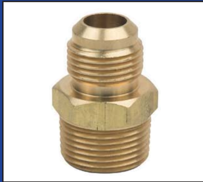
3/4" MPT x 5/8" Flare