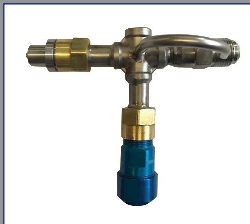
Caire / PB Dual Fill Head P714