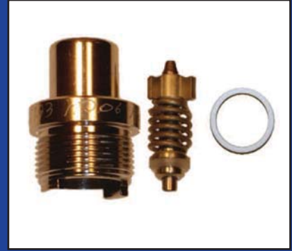
Caire Posi-Lock Fill Tip