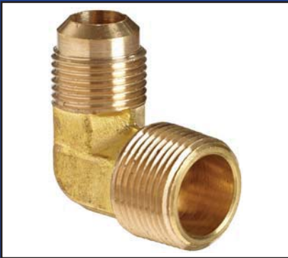
3/4" MPT x 5/8" Flare 90 Degree