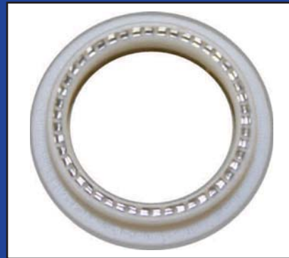
Metal Lip Seal