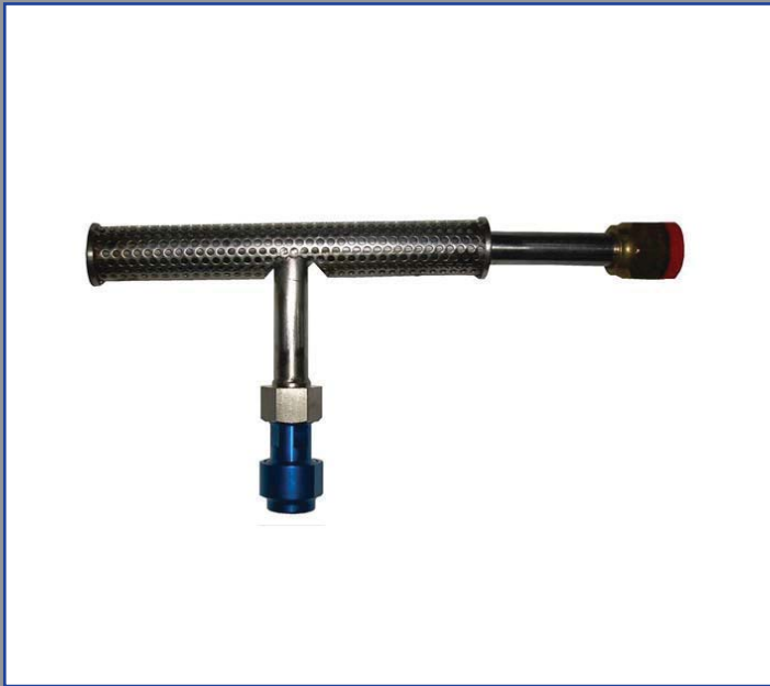
PB Fill Adapter Assembly P715